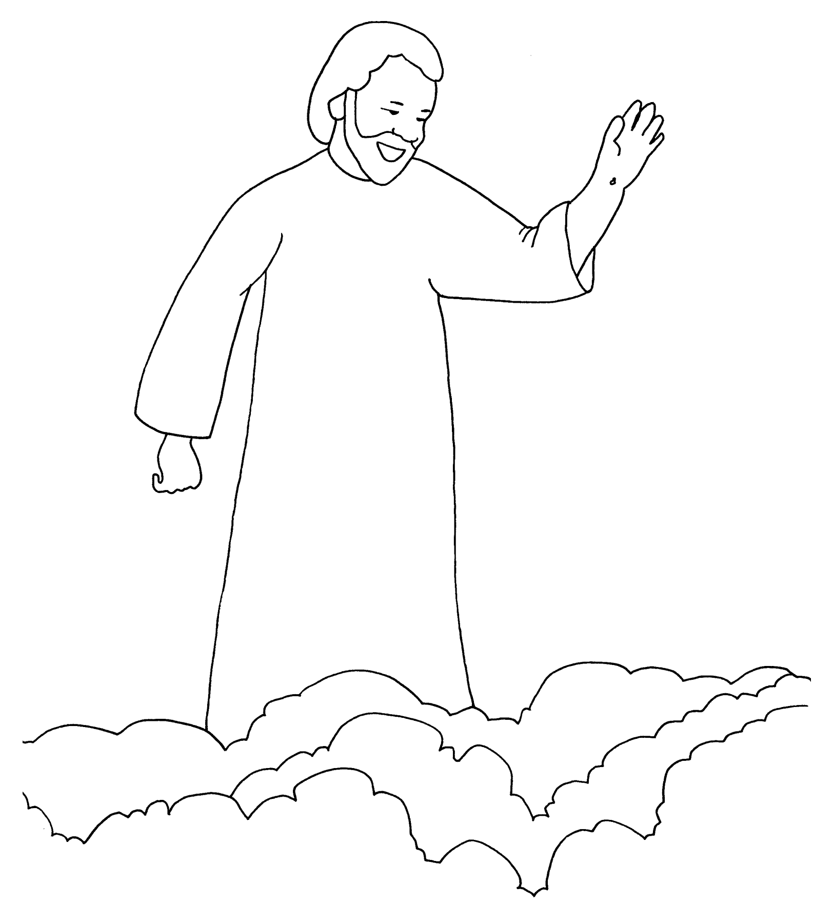
Jesus is coming for us