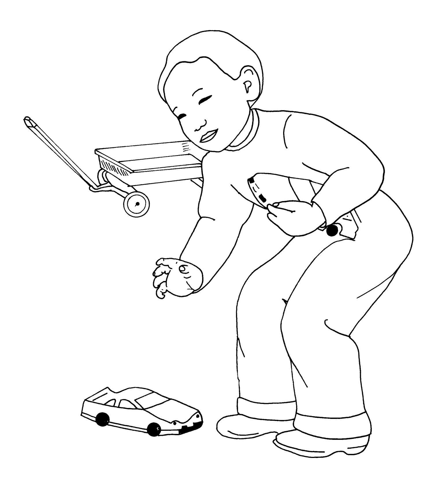
You can please God like Jesus pleased God