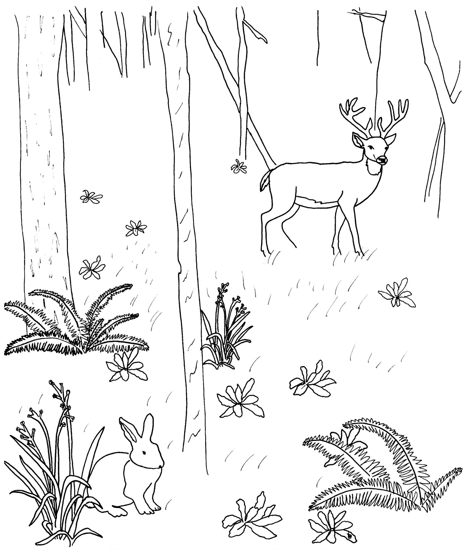
Be still and know that I am God... Psalm 46:10 NKJV