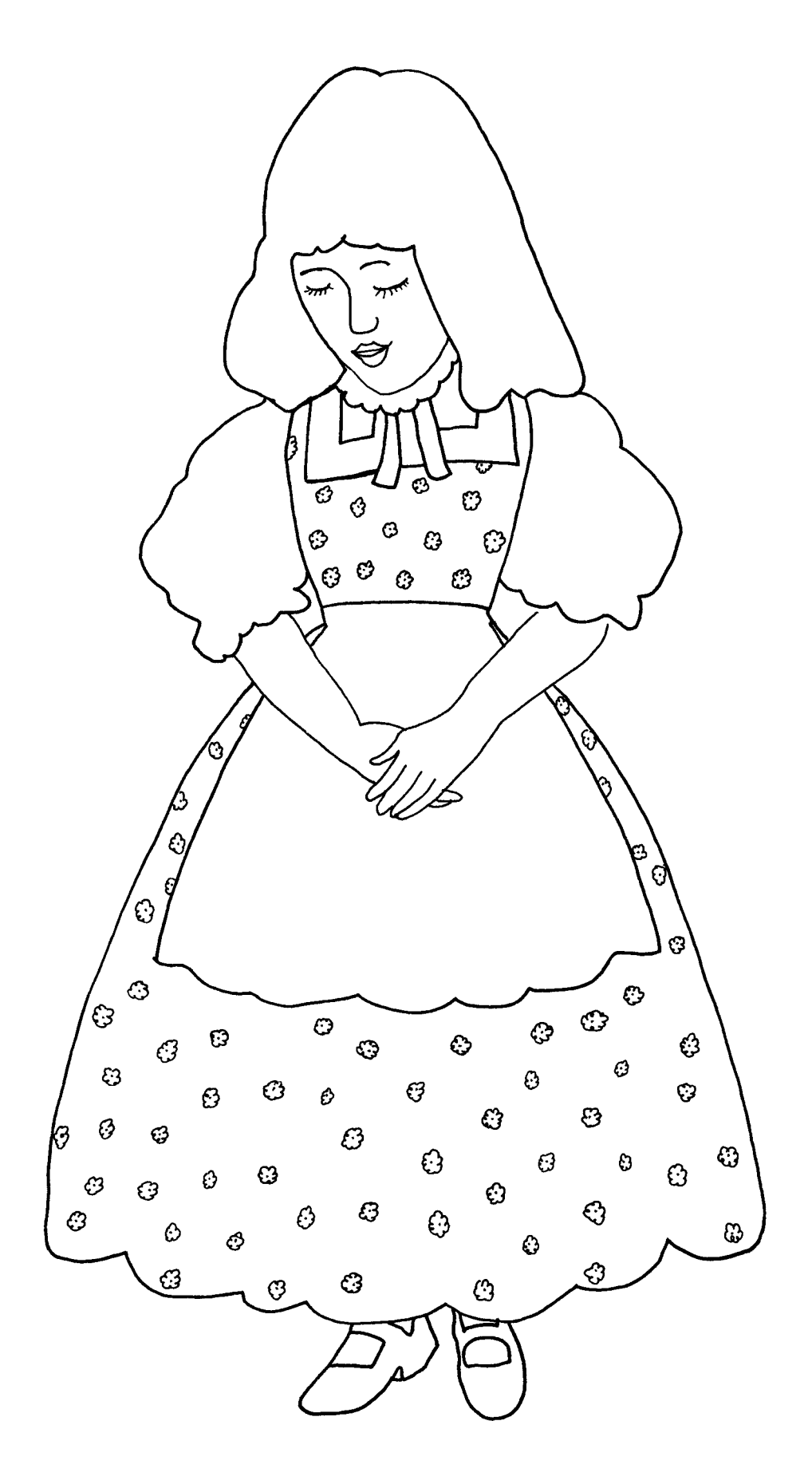
DAY AND NIGHT GOD SPEAKS TO ME