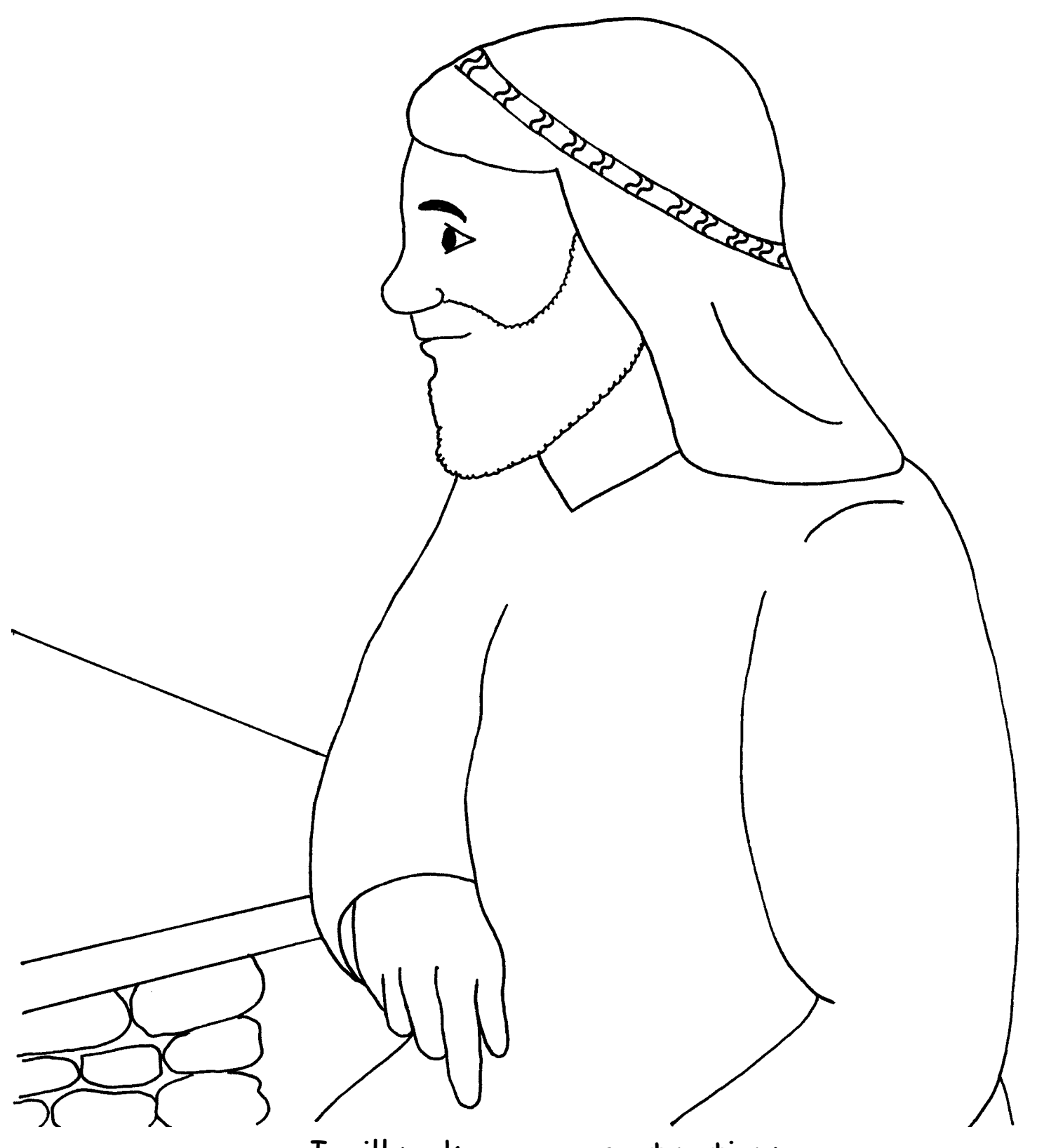
I will make you a great nation; I will bless you And make your name great; And you shall be a blessing. Genesis 12:2