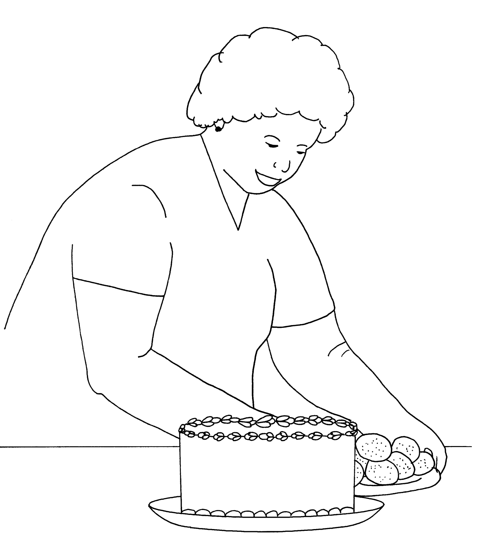
Jesus brings the blessing of Abraham to you