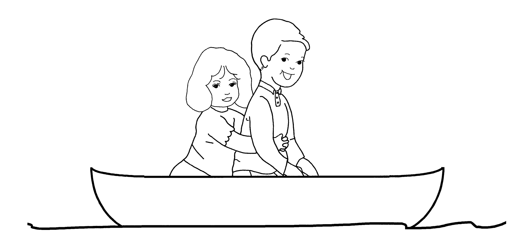
You can know God as a friend