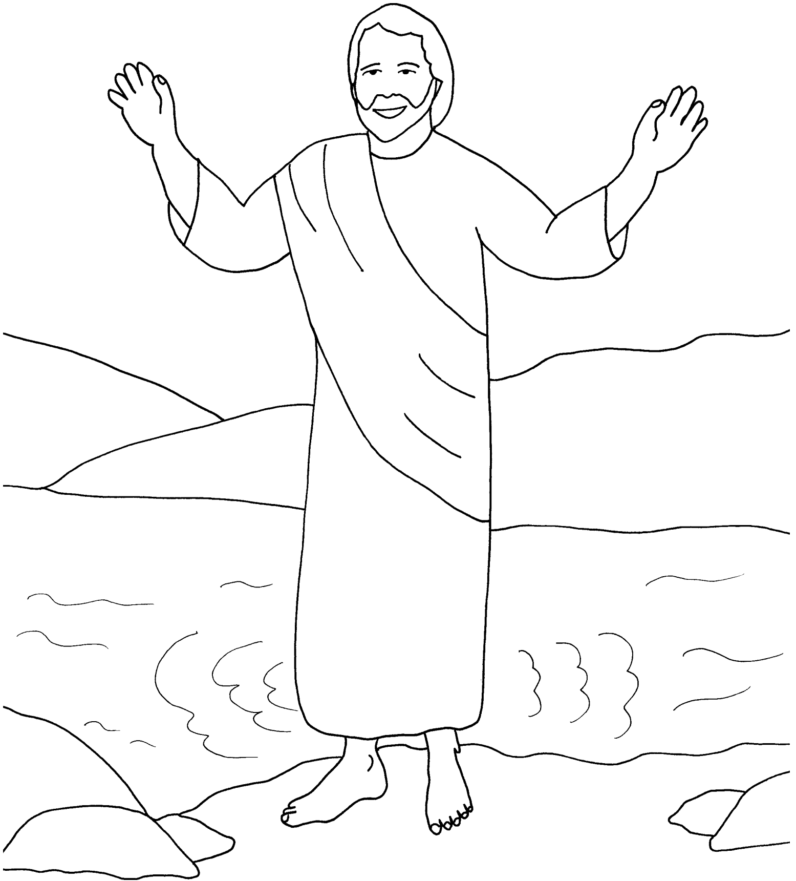
Jesus pleased God