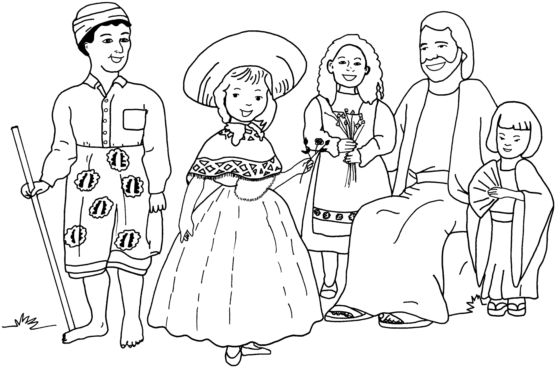
Jesus is our covenant friend