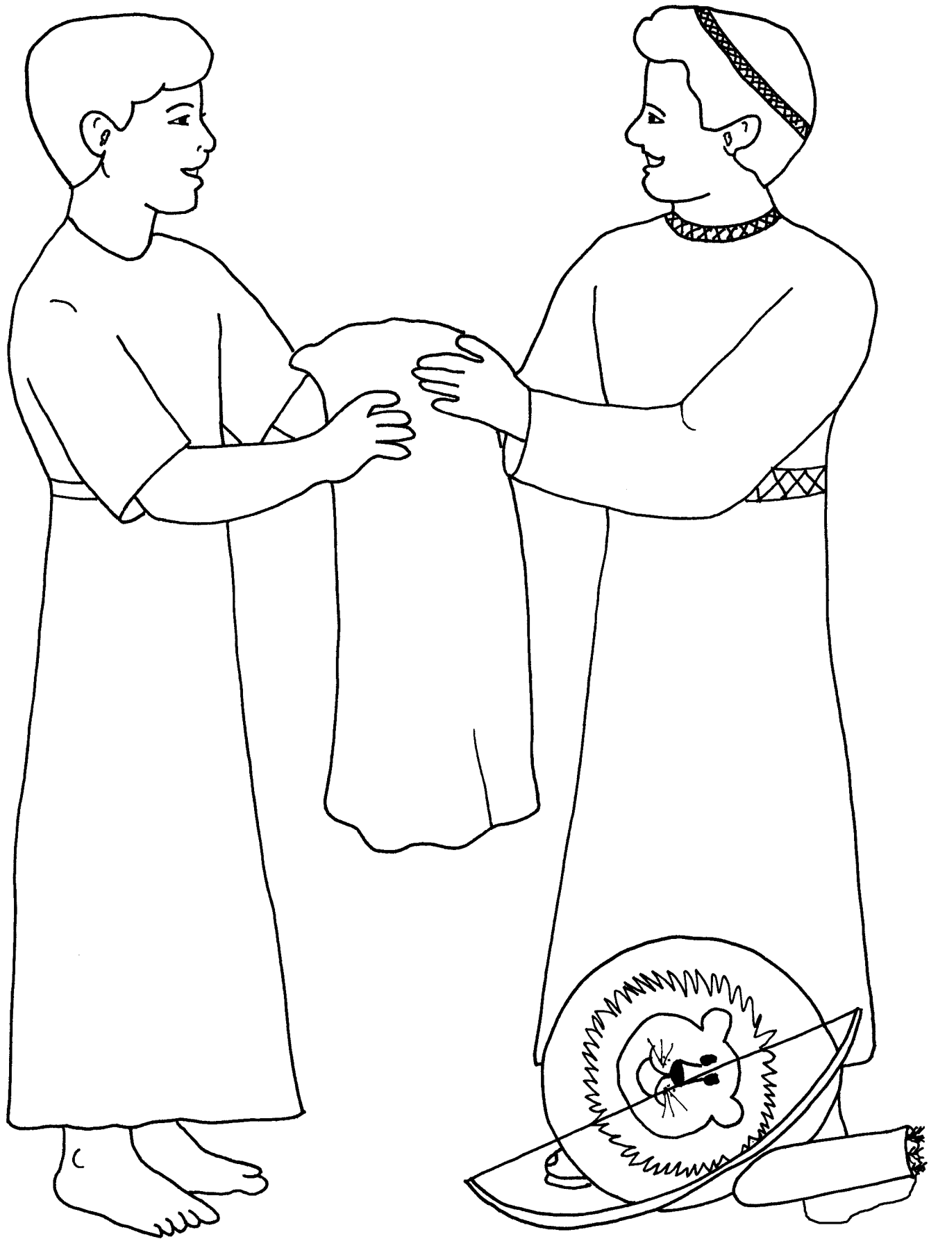
Jonathan made a covenant with David and gave him gifts